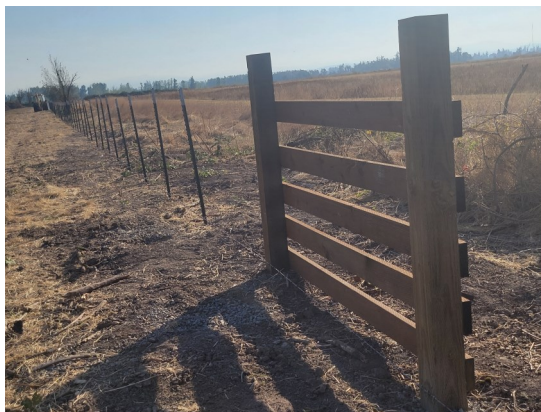
September 26. Interior bracing. Barbed wire and T-posts in place.