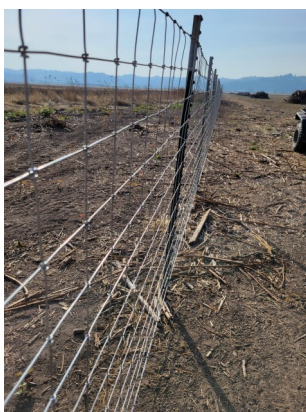
October 10, 2022. Clip-pies on woven wire.