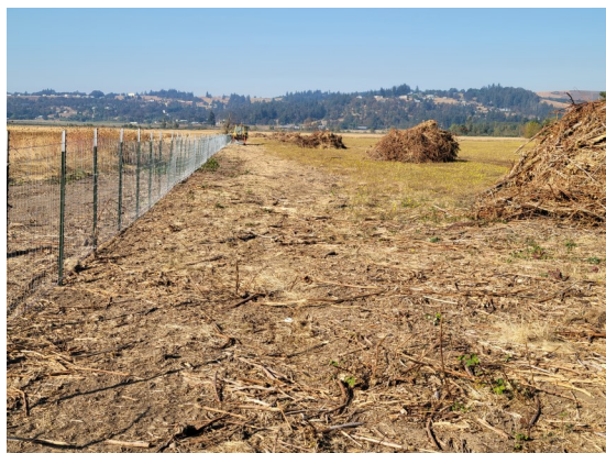
September 26, 2022. Pulling woven wire with backhoe.