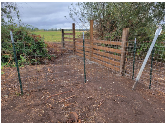
September 29, 2022. East corner. We had to fill in a portion of the ditch.