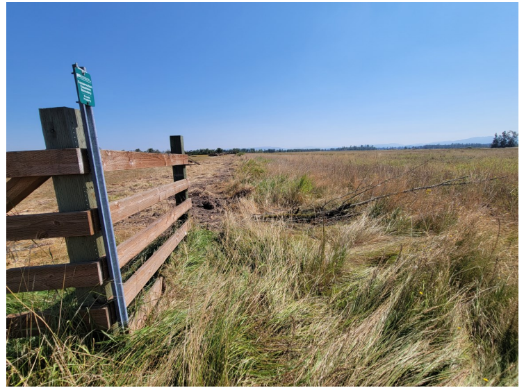
August 11, 2022: 1129 foot woven fence project from post heading due East to the trees in the background.