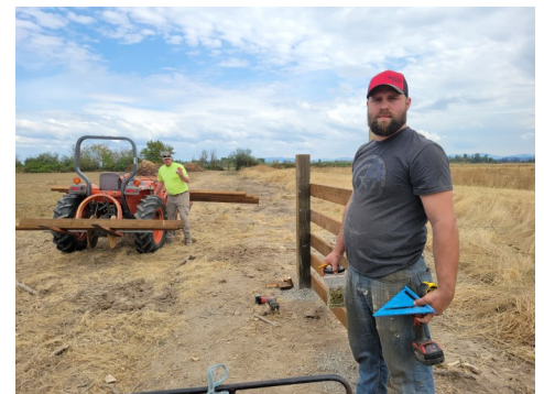
September 18-29. Mini excavator and crew arrive to lay out line, dig post holes and set posts in gravel, set wooden braces, lay out bottom barbed wire, place T-posts, and lay out woven wire.